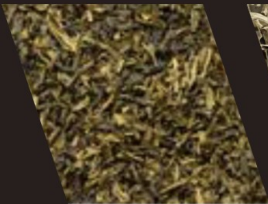
4. Darjeeling Green Tea USD$ 26.23 TO 99.09