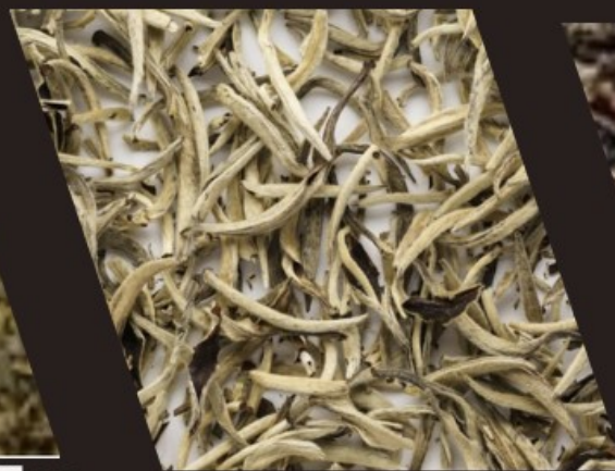
5. Darjeeling White Tea. USD$ 56.00 to 150.00