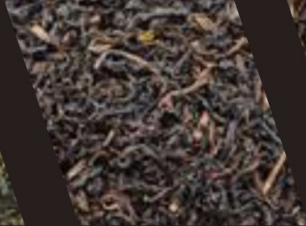
2. Second Flush Darjeeling Tea USD$ 10.70 TO 200.00