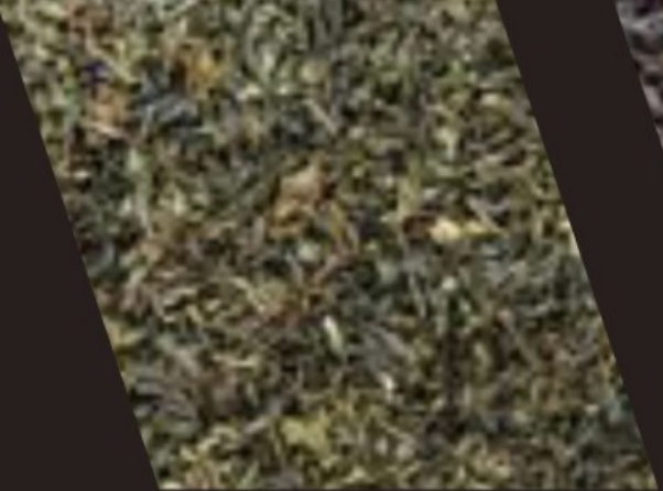
1. First Flush Darjeeling Tea USD$ 10.70 TO 56.00

Rates in per Kilograms ALL THE PRICES ARE IN USD$ RATE TODAY 1USD$ =83.97 INR