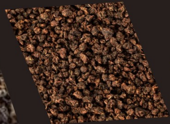
8. Assam/ Dooars CTC Tea USD$ 3.60 TO 4.60