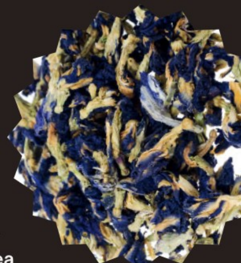
9 . BLENDED BLUE TEA USD$ 71.

ALL THE VARIETIES COULD NOT BE SAMPLED PLEASE ASK FOR THE SAMPLE WRITE- "TEA"- AND WHATSAPP AT +919002548883