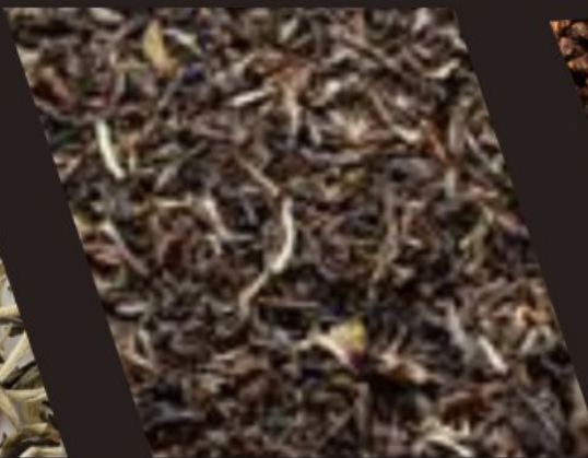
6. Organic Darjeeling Tea USD$ 11.02 TO 200.00