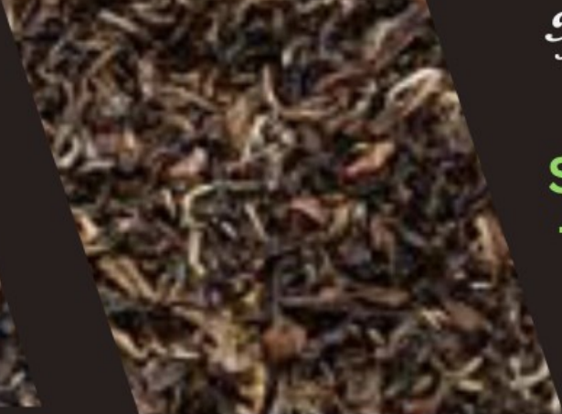
3. Autumn Flush Darjeeling Tea USD$ 10.70 TO 56.00